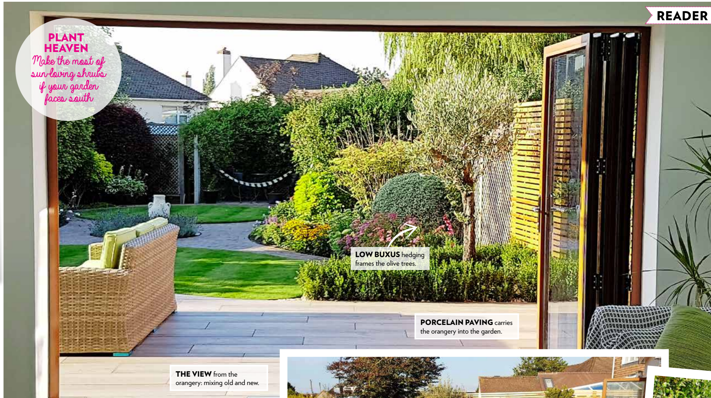
LOW BUXUS hedging frames the olive trees.

PLANT HEAVEN Make the most of sun-loving shrubs if your garden faces south