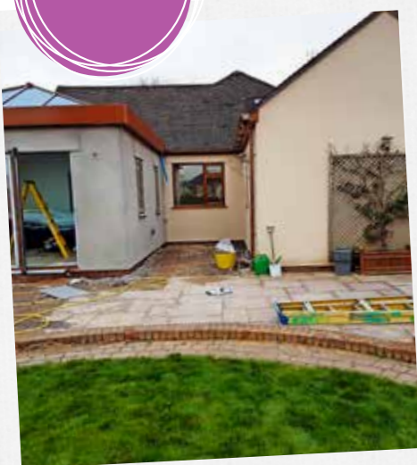
The old patio wasn't doing the garden any favours!