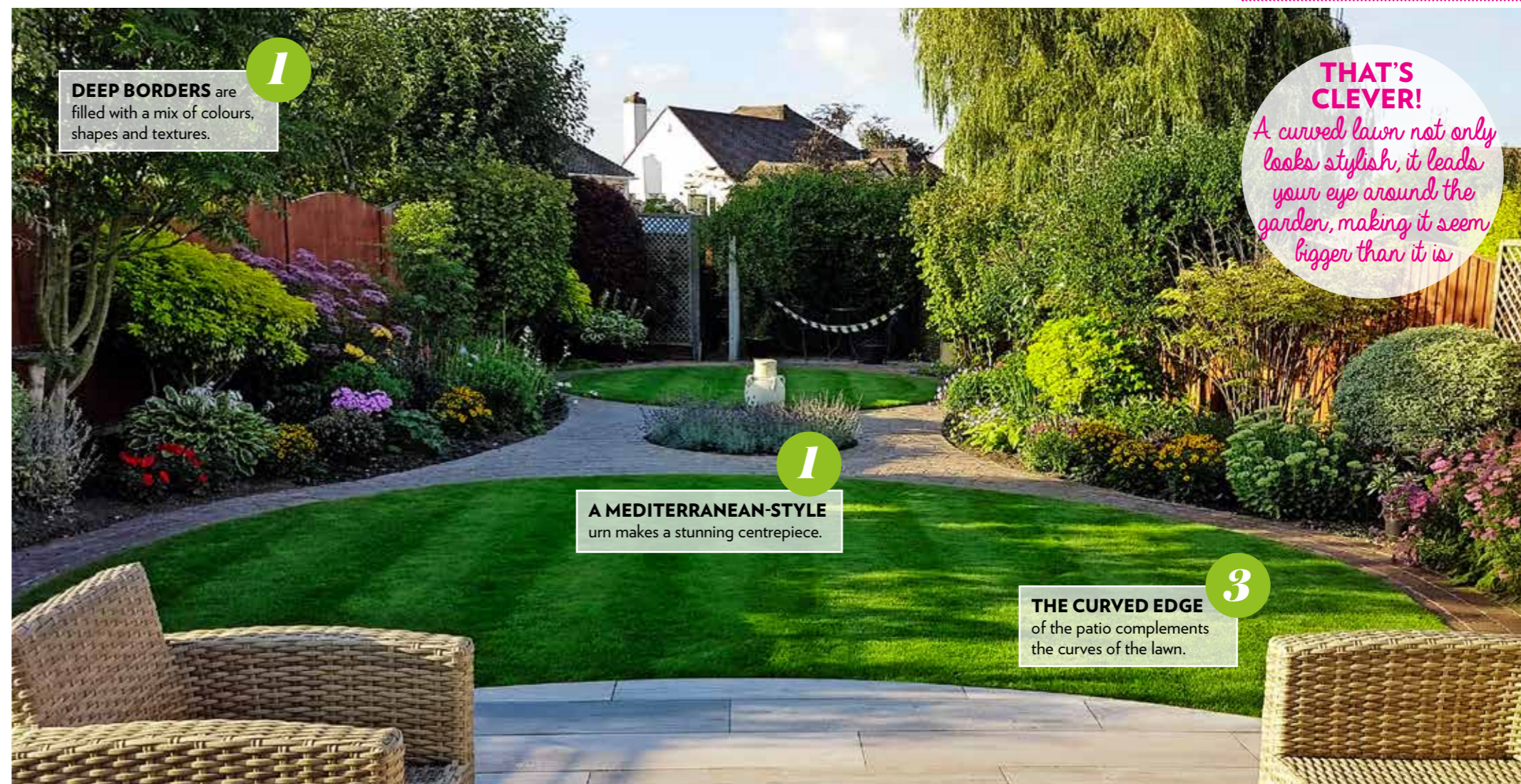
1 DEEP BORDERS are filled with a mix of colours, shapes and textures.

Having looked at several options on their shopping expeditions, Norman and Mahin decided on ‘Cassetta Greige’ Italian porcelain paving for the terrace. This has the appearance of bleached and weathered wood, giving a Mediterranean appeal but crucially needing no maintenance. The ‘planks’ were laid horizontally to create a feeling of width in the long garden. A neat finish was achieved with weather-resistant Cor-ten steel edging to pick up the detailing of the orangery.