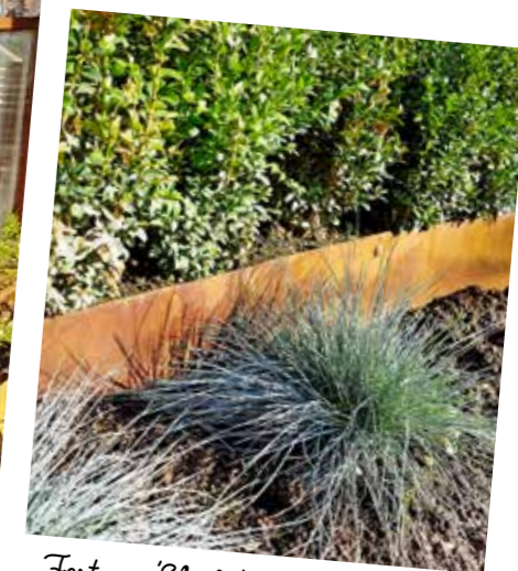
Festuca 'Elijah Blue' grasses soften the industrial steel edging