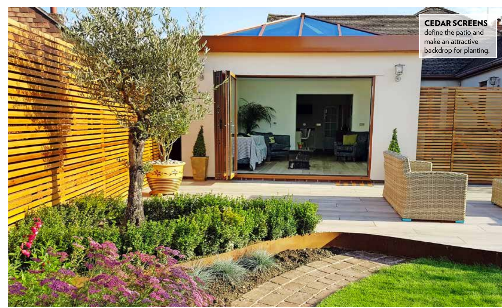
CEDAR SCREENS define the patio and make an attractive backdrop for planting.

WORDS: DI WARDLE. MORE INFORMATION: GREENBIRDGARDENING.CO.UK