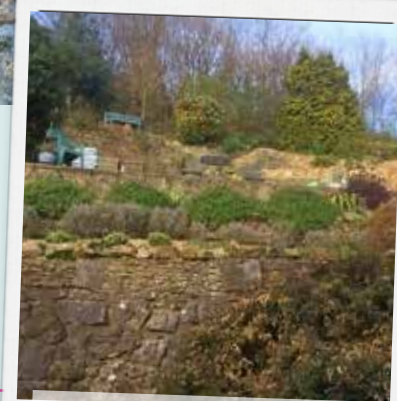
The overgrown hillside garden before the transformation

"This project in Portishead had a similar challenge.